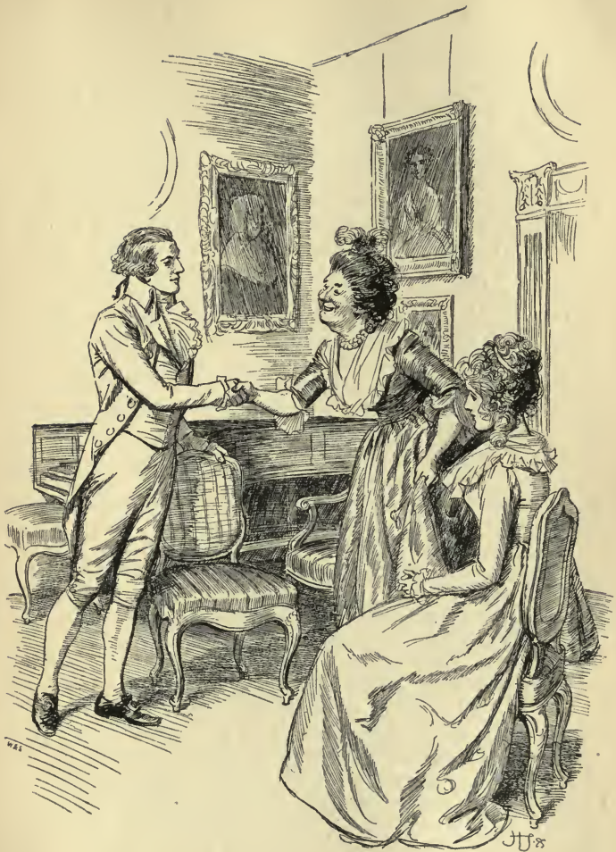
Mrs. Jennings assured him directly that she should not stand upon ceremony.